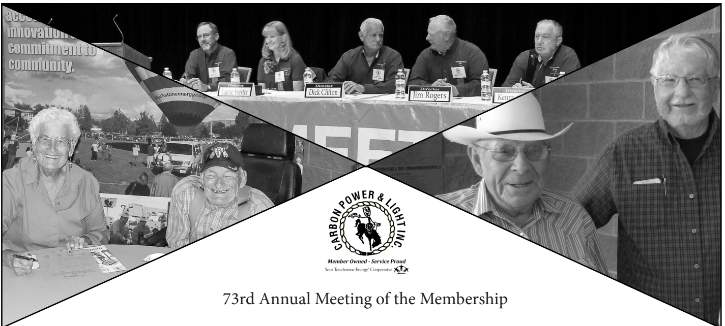
73rd Annual Meeting of the Membership