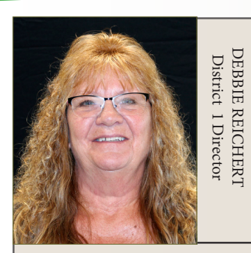
Board Actions SEPTEMBER 2022

Approved the Department Production and Financial Reports.