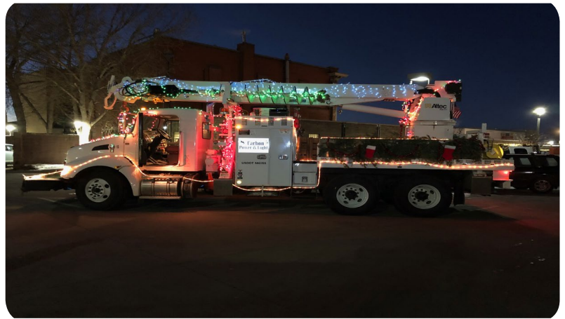
Carbon's bucket truck decorated for the Laramie parade.